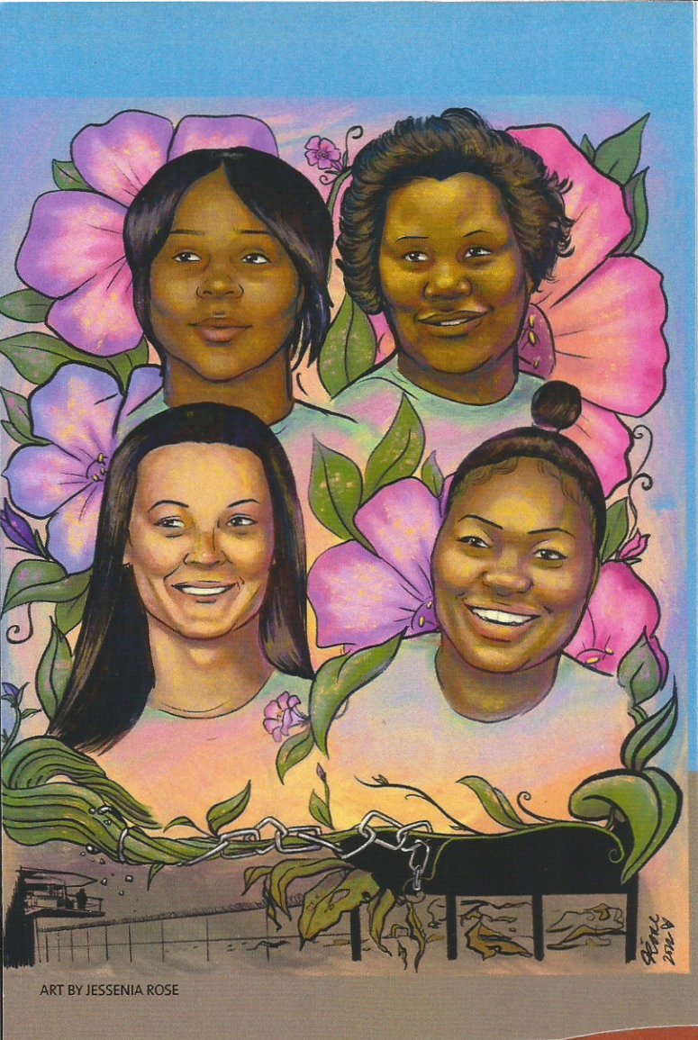
ART BY JESSENIA ROSE