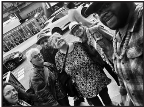
Prison Radio Board at City Lights in San Francisco!